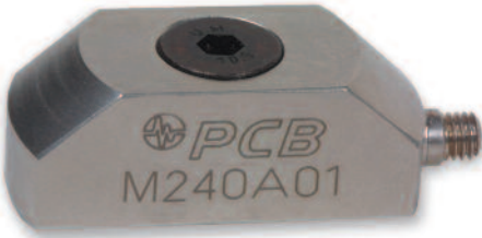
Series M240 ICP® Strain Sensors