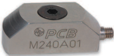
Series M240 ICP® Strain Sensors

As with all PCB® instrumentation, these products are complemented with toll-free applications assistance, 24-hour customer service, and are backed by a no-risk policy that guarantees satisfaction or your money refunded.