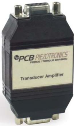
Series 8160 In-Line Strain Gage Signal Conditioner

The Series 8160 is designed for use with strain gage load cells and reaction torque sensors. The unit provides the necessary, regulated, strain gage excitation voltage and delivers both voltage and current mode output signals for recording, control, or analysis purposes. Zero and span adjustments are achieved via screwdriver adjustable potentiometers. The in-line design makes it a convenient choice for use with PLCs and computer based data acquisition systems.