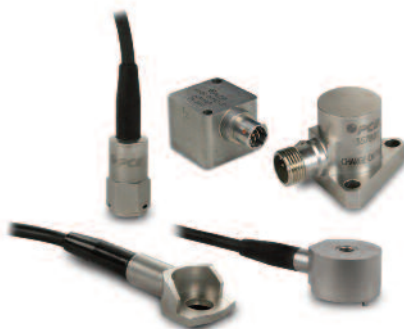
Sensors for Flight Monitoring and Predictive Maintenance

These units showcase ICP® and charge output operation, ceramic and quartz sensing elements, and a variety of hermetically sealed physical configurations. While this sensor family represents a sampling of solutions used for this critical application, advanced design capabilities permit PCB to customize solutions specific to your requirements. Please inquire to learn which solution is right for your application.