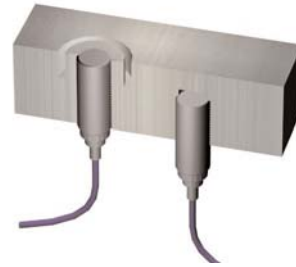
Figure 11: Strain Isolated Pressure Transducer Left – Isolated “Check” Transducer Right

(Please refer to PCB Tech Notes 12 and 13 for full text of Parts I and II of the “Introduction to Air Blast Measurements” Series)