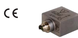
UHT-12™, ICP® TRIAXIAL ACCELEROMETER MODEL 339B32

Sensitivity: \pm 500 g pk Measurement Range: 10 mV/g Frequency Range ( \pm 5\% ): 2 to 8k Hz