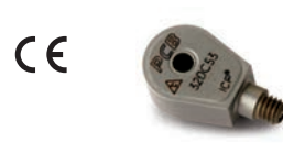
ICP® ACCELEROMETER MODEL 320C53

Sensitivity: \pm 500 g pk Measurement Range: 10 mV/g Frequency Range ( \pm 5\% ): 1 to 10k Hz