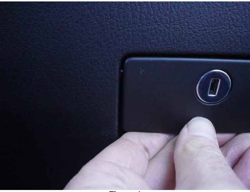
Figure 1 Typical Glove Box Latch

A recent automated assembly line for a plastic over-molded, spring steel, automotive glove box latch (see figure 1) was designed with a latch effort inspection station that required measurement very small forces in-process. However, the machine and operators can cause very high overloads as part of normal machine use. Thus the customer required a force sensor that was durable enough for the environment, yet sensitive enough for the required measurement.