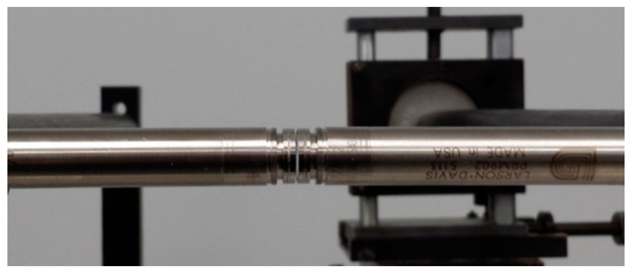
Figure 5: Two microphones fixtured such that their diaphragms are the proper distance apart for a pressure calibration. Note the adjustment axes in the background to assist in dialing in the location of the test sensor.

Pressure calibration can be carried out in almost any environment, as long as the source output is at least 30dB greater than the background noise. The test method is a true comparison technique, in which the diaphragm of a calibrated reference is placed in very close proximity (<1mm) to the diaphragm of the test sensor. This is to ensure that the detected sound field on both diaphragms is as identical as possible. The methodology for the test allows for one of two possibilities. Either both microphones are placed in a coupler facing one another, with paths to allow a signal to reach the diaphragms, or the microphones are fixtured such that the diaphragms are in close enough proximity. An example of the latter is shown below.