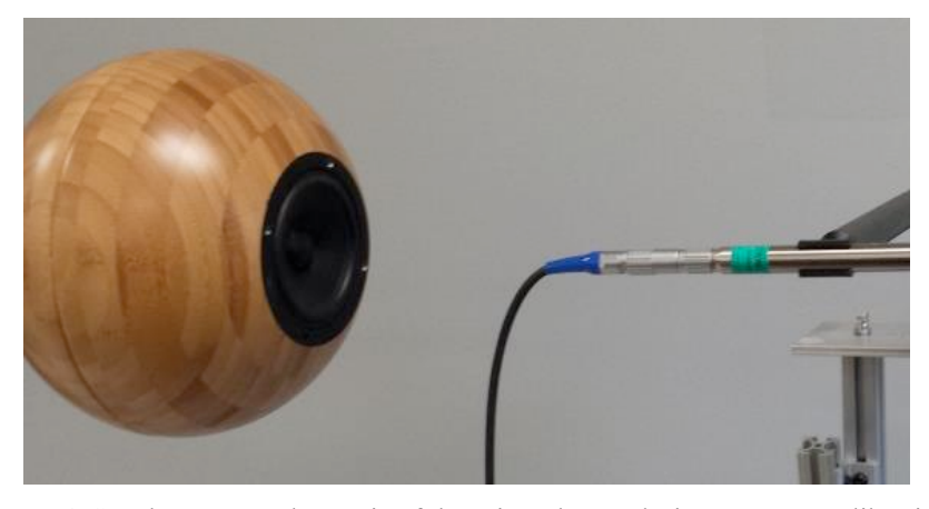
Figure 6: Speaker arranged on axis of the microphones during pressure calibration.

The sound source should be radially symmetric about the normal of the diaphragms. This can be accomplished by revolving a source around the normal and averaging the responses, by having a radial symmetric source, or by placing the source on axis with the normal of the diaphragms. The last method is displayed below.