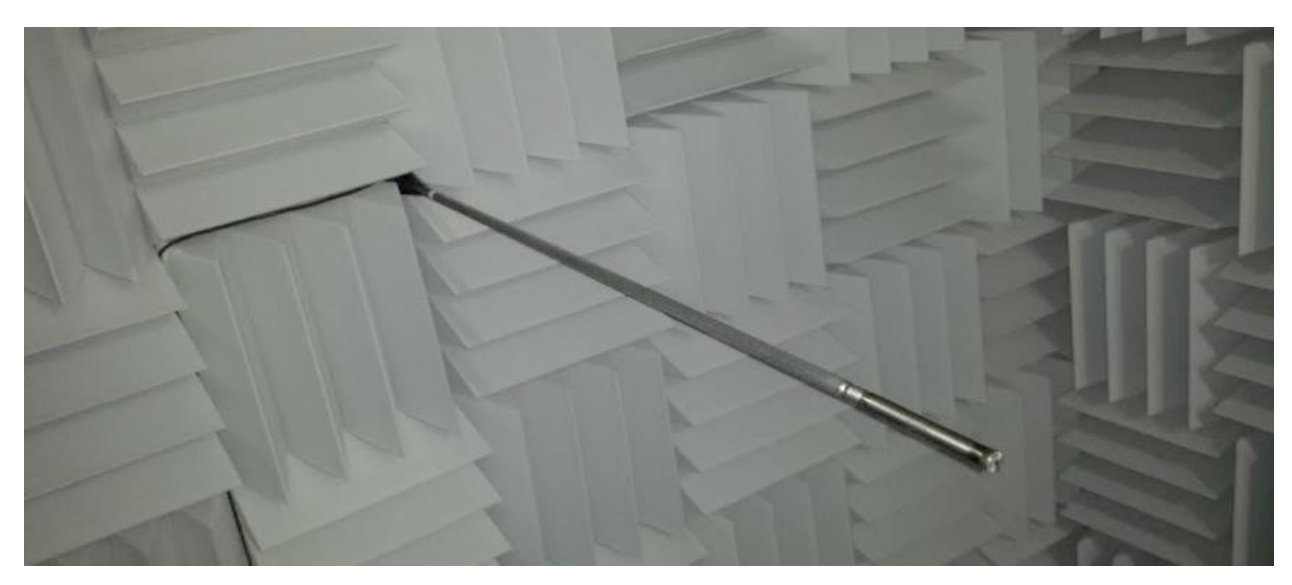
Figure 4: Wall mounted rod fixture for free field calibration.

The calibration is performed by exposing the reference microphone to the sound field, taking a measurement, and then using the test microphone to measure the (ideally) identical field. The frequency response of these two measurements is computed, then the free field response of the reference is subtracted from the paired response to define the final response of the test article.