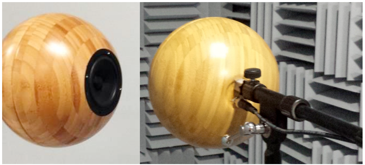
Figure 2: Spherical speaker front and back view.

The stability of the sound source is very important to the repeatability of the measurements. As the speaker is used, it will warm up which can cause the output to change. Prior to operation, the source should be run several times to increase repeatability. Maintaining an identical sound field when the reference and test sensors are installed is extremely important for repeatability of this measurement. The source should be in the 70-80dB (re 20\mu\text{Pa} ) range throughout the frequencies of interest in order to maintain good signal to noise ratio. Below is an image of a spherical sound source.