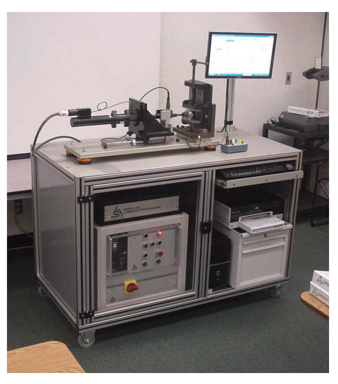
Portable Fastener Test System

Rotary Torque Angle Transducers, Thread Torque Clamp Force Load Cell, DC Drive Motor & Controller, Fixture Assembly, Portable Test Cart