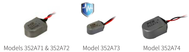
Products Shown at Actual Size

These miniature teardrop ICP® accelerometers feature three different sensitivity options and a flexible twisted pair integral cable for easy routing. Flexible potting material adds strain relief where the cable exits the sensor. All the accelerometers are hermetically sealed in a titanium package. Model 352A72 includes an electrical low pass filter to suppress high frequency noise and decrease the chance of amplifier saturation.