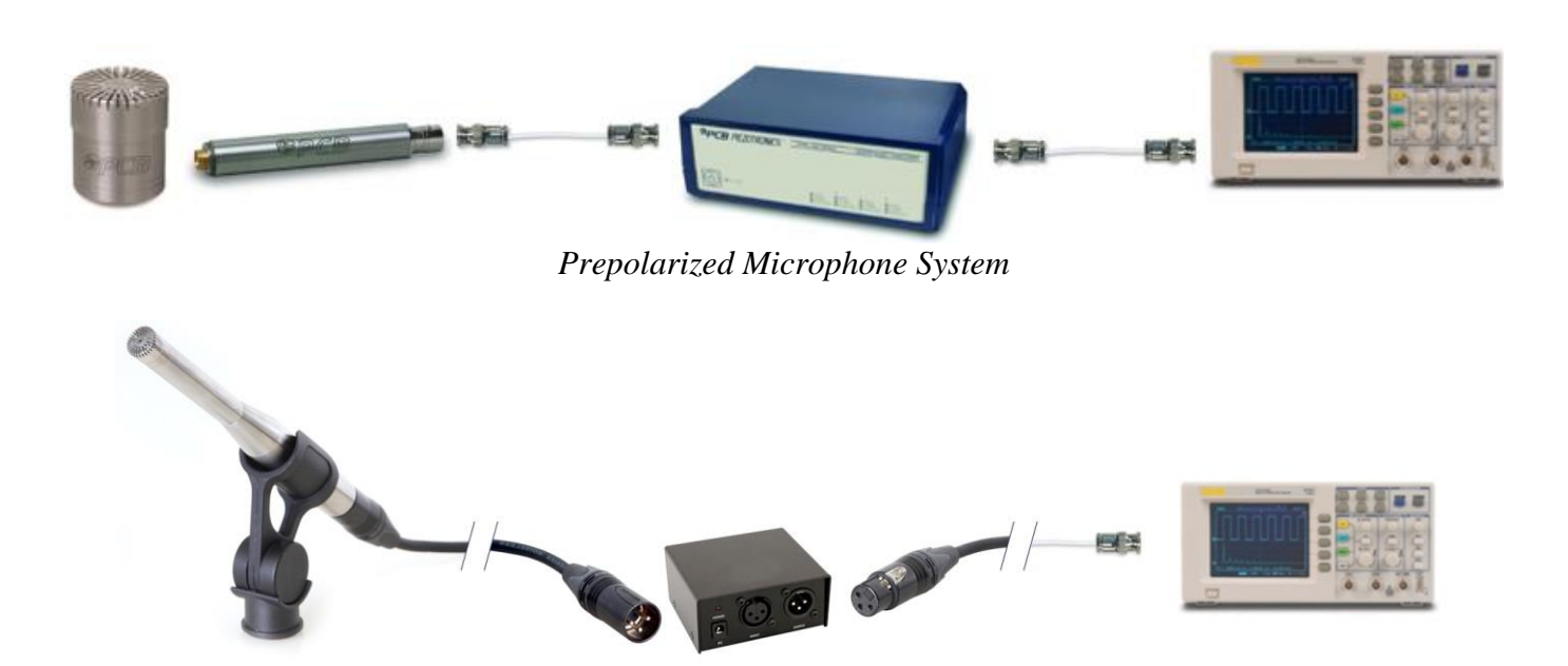
Phantom Powered Microphone System

The phantom powered preamp may be used with either a ½" or a ½" microphone cartridge by using the adapter provided. All IEC 61094-4 compliant microphones can be used with the phantom powered preamp.