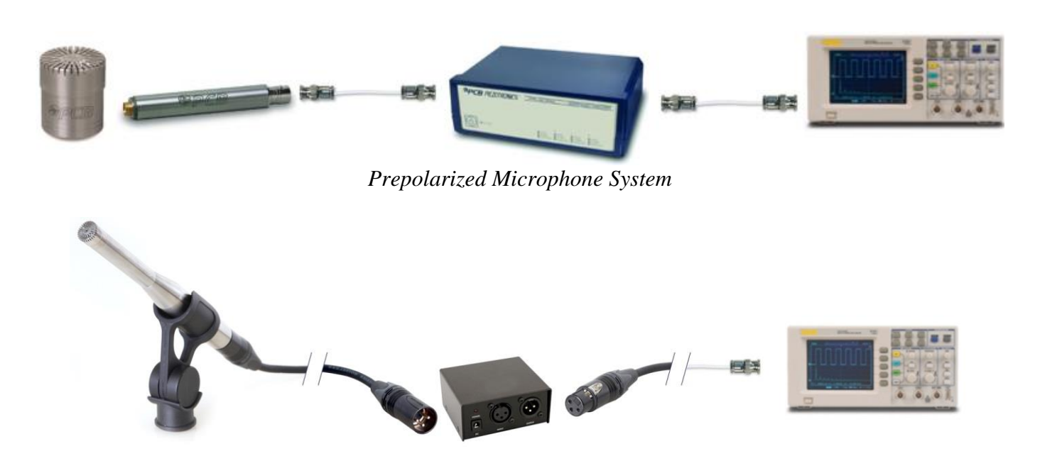
Phantom Powered Microphone System

The phantom powered preamp may be used with either a ½" or a ½" microphone cartridge by using the adapter provided. All IEC 61094-4 compliant microphones can be used with the phantom powered preamp.