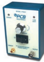
Model 478A01 Single-channel unity gain internal battery powered