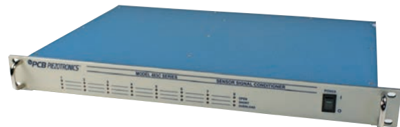
Model 483C28 8-channel line-powered bridge, differential, and ICP® sensor types