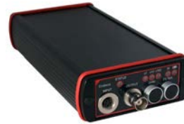
Endevco Model 4418 Single channel x1, x10, x100 gain battery powered