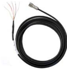
Model 037P10 | 037G10 Cable 10 ft (3m) 9-Socket Plug to Pigtails