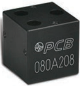
Model 080A208 Triaxial mounting block