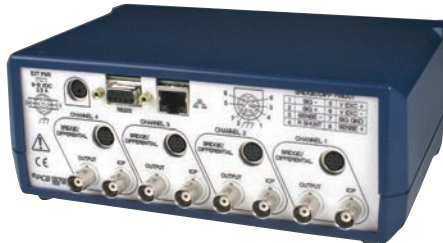
SERIES 482C 4-CHANNEL SIGNAL CONDITIONER