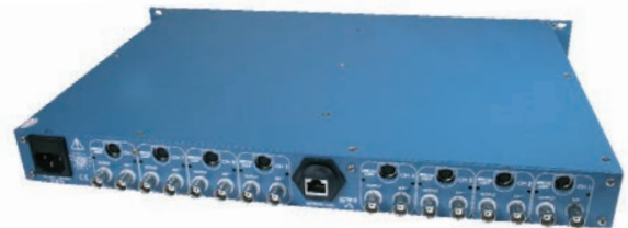
SERIES 483C 8-CHANNEL SIGNAL CONDITIONER

All models that have an RS-232 or Ethernet interface are supplied with PCB's Multi-Channel Signal Conditioner Control software. This easy to use software displays a table of the unit's current settings versus channels. Users can change any setting by simply changing values in the table. Typical settings include Input Sensor Type, Gain, Filtering, and Constant Current Excitation.