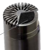
Water Resistant Cover