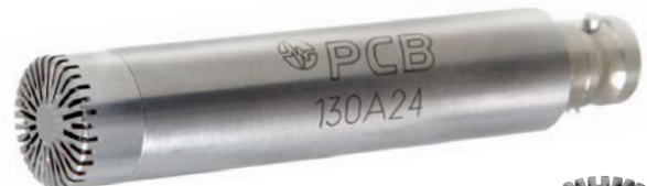
Model 130A24 Water & Dust Resistant (BNC Jack)