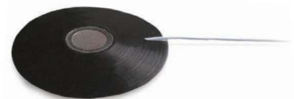
Model 130B40 Low Profile Surface Microphone Pad