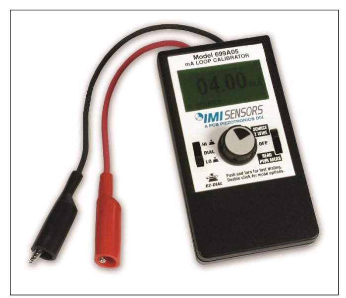
Figure 18 – Loop Calibrator

The loop calibrator (Model 699A05) provides 24V loop power and displays the transmitters electrical current output. This can be used with the sensor for measuring the baseline peak acceleration as described in "Determine Baseline Vibration using the RMP" on page 12. Visit www.pcb.com for more information on the loop calibrator.