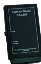
Model CAL200 Acoustic Calibrator