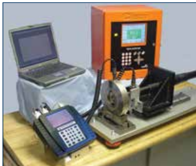
Torque Tension Test System