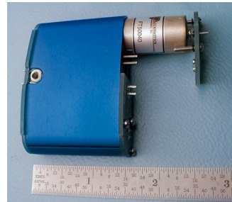
Installation of AT-5000 2/3 Length AA Battery

The picture above left shows the rotating AT-5000 EasyApp Transmitter; the low profile transmitter is held on to the driveshaft with an aramid fiber strap. It is easily mounted to the driveshaft using an Allen wrench. On the right is a close up of the input side of the transmitter. The gain resistor is on the front of board as shown; the resistor (or the entire input board) can be easily changed to adjust the sensitivity of the system.