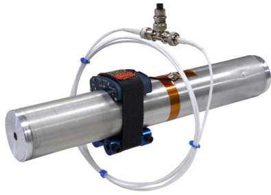
AT-5000 EasyApp (Mounted on automotive Driveshaft)