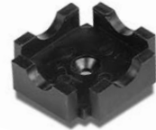
Model 080A152 Easy mount clip, 3711