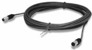
Model 010D10 Cable 10 ft (3 m) 4-pin plug to 4-pin plug