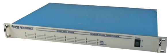
Model 483C28 8-channel line-powered bridge, differential, and ICP® sensor types