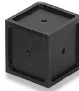
Model 080A153 Easy mount triaxial block, 3711