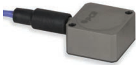
Series 3711F12 (with integral cable)