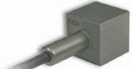
Series 3713F12 (with integral cable)

Precision Series 3741 MEMS DC Response sensors are low-profile and low-mass with mechanical overload stops and a hard-anodized aluminum housing for added durability. The units offer a differential output signal for common-mode noise rejection and incorporate many advanced features. This includes supply voltage regulation and a proprietary temperature compensation circuit for stable performance over the entire operational temperature range. Each unit is provided with an integral, 4-conductor, 10 ft (3 m) shielded cable. An optional mounting adaptor, model 080A208, facilitates triaxial measurement configurations.