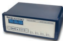
Model 482C27 4-channel incremental gain differential, bridge, and ICP® sensor types