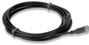
Model 037P10 Cable 10 ft (3m) 4-pin plug to pigtails