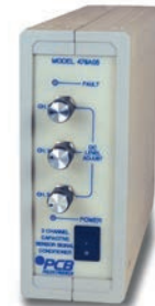
Model 478B05 3-channel unity gain 36 VDC powered optional external battery pack