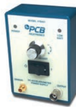
Model 478A01 Single-channel unity gain internal battery powered