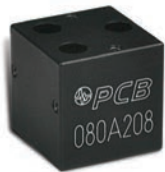
Model 080A208 Triaxial mounting block