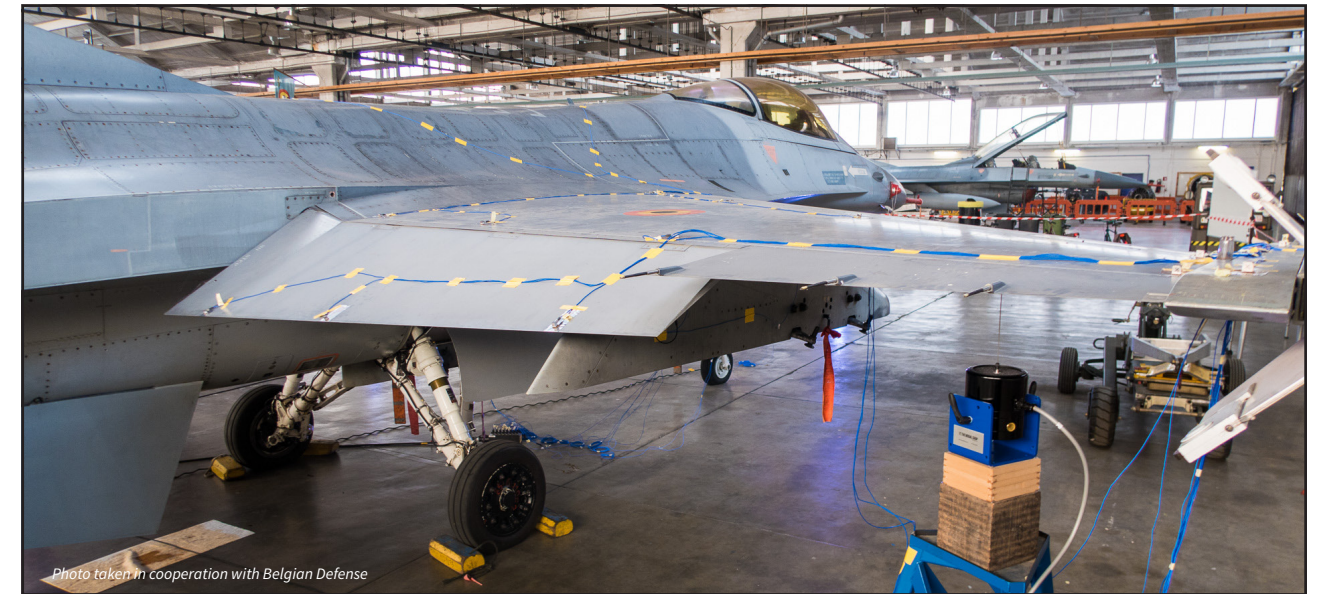
MD-0316 revA 1217