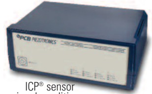
ICP® sensor signal conditioner