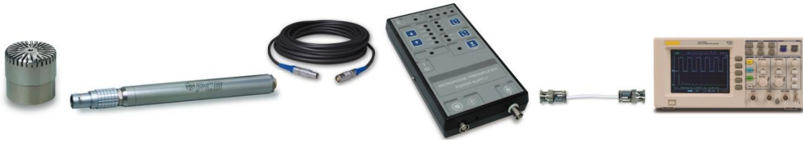
Externally Polarized Microphone System

Phantom powered microphone systems use a 3 pin XLR connector. A phantom powered microphone system should use a 48V phantom power supply or signal conditioner for optimum performance; however these microphone systems may be powered with a 24V or a 12V phantom power supply, but this will limit the maximum output voltage.