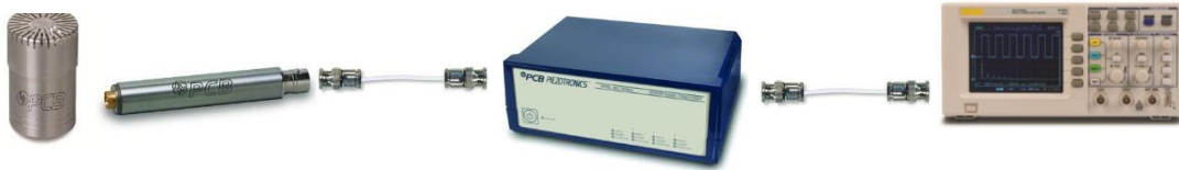
Prepolarized Microphone System