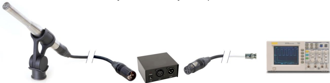
Phantom Powered Microphone System

The phantom powered preamp may be used with either a 1/4" or a 1/2" microphone cartridge by using the adapter provided. All IEC 61094-4 compliant microphones can be used with the phantom powered preamp.