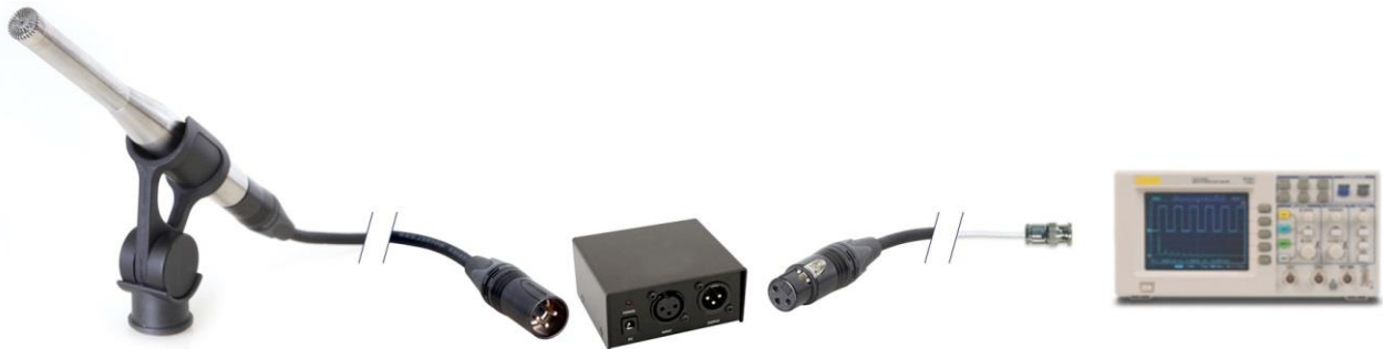
Phantom Powered Microphone System

The phantom powered preamp may be used with either a 1/4" or a 1/2" microphone cartridge by using the adapter provided. All IEC 61094-4 compliant microphones can be used with the phantom powered preamp.