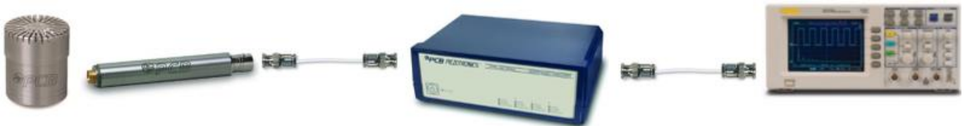
Prepolarized Microphone System