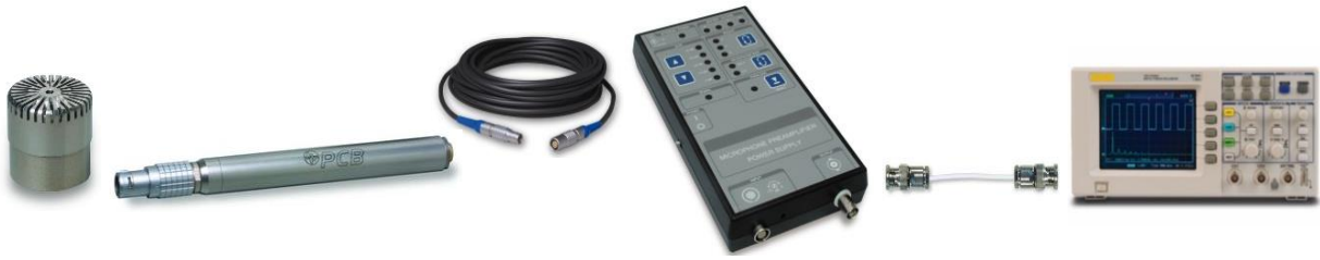
Externally Polarized Microphone System

Phantom powered microphone systems use a 3 pin XLR connector. A phantom powered microphone system should use a 48V phantom power supply or signal conditioner for optimum performance; however these microphone systems may be powered with a 24V or a 12V phantom power supply, but this will limit the maximum output voltage.