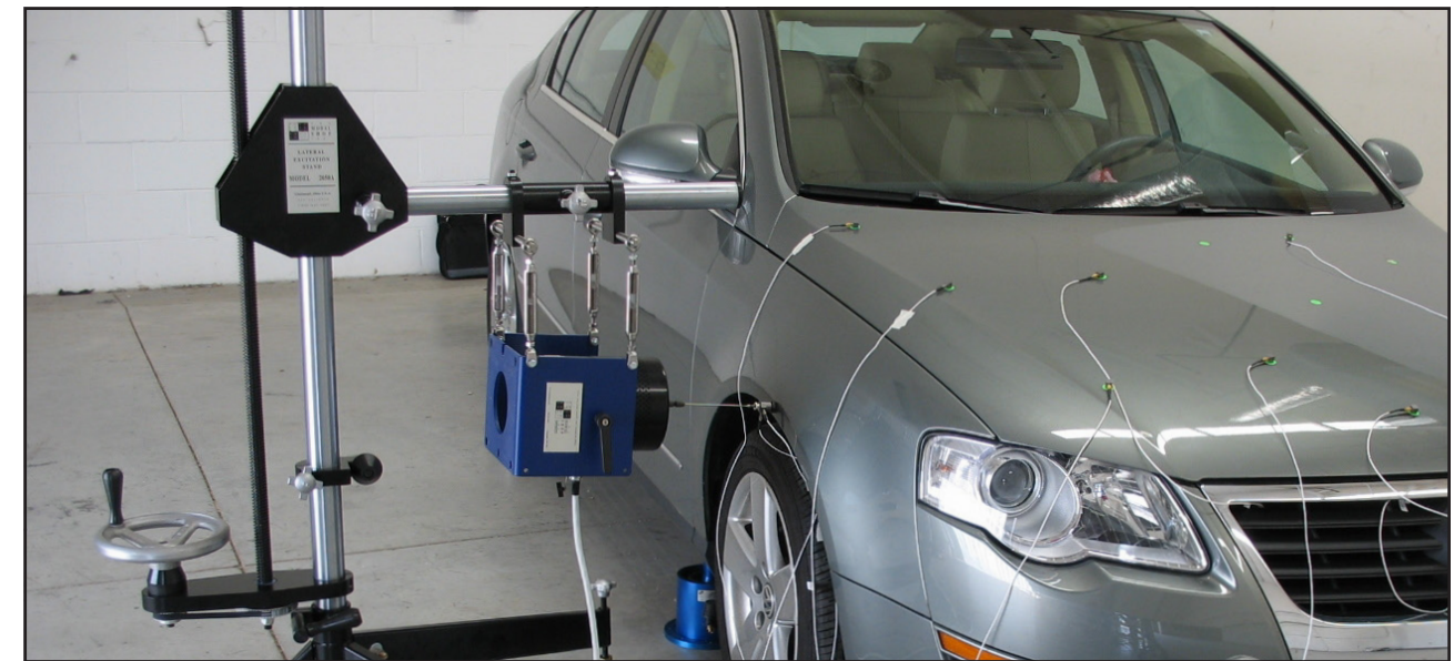
MD-0348 rev/NR 0518