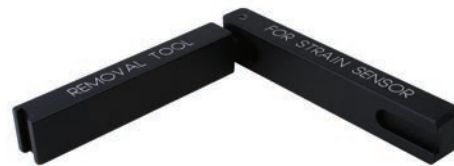
Model 039A07 Removable Tool