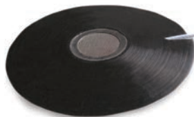
Model 130B40 Low Profile