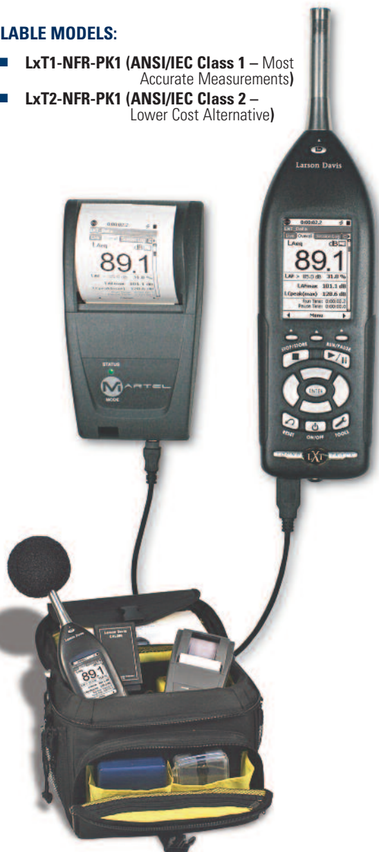
N/Forcer Road Kit