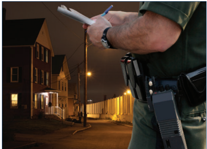
Handle noise complaints easily with N/Forcer Noise Meter