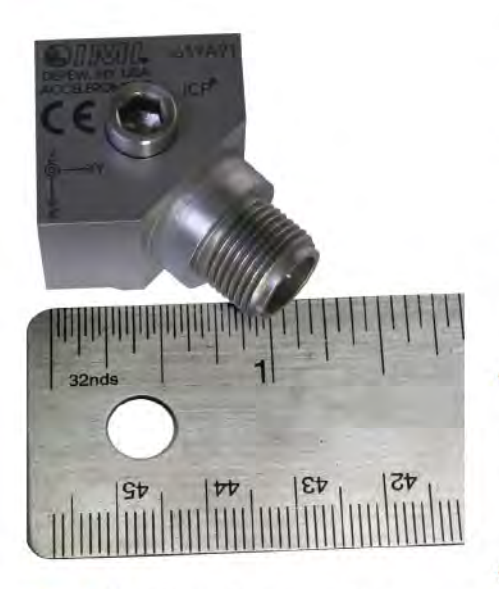
Figure 3: A triaxial accelerometer with a footprint less than one inch square and a 13kHz frequency response on all three axes

tor. Rather, it is determined by the housing material, the level of seal the housing provides and the electrical isolation of the housing. Most industrial accelerometer housings are 304 or 316 stainless steel and hermetically sealed in order to withstand chemical exposure and wide operating temperature ranges. An isolated case housing allows an accelerometer to be mounted on equipment with poor electrical grounding without running the risk of signal contamination. This isolation is typically achieved with the use of a Faraday cage, a continuous enclosure around the sensor's electronics to repel noise.