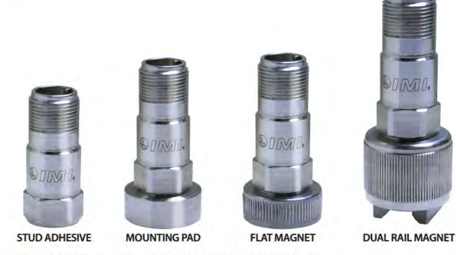
Figure 2: Four common mounting methodologies for accelerometers

Can Install on Curved Surfaces: Mounting a sensor on a curved surface with a mounting