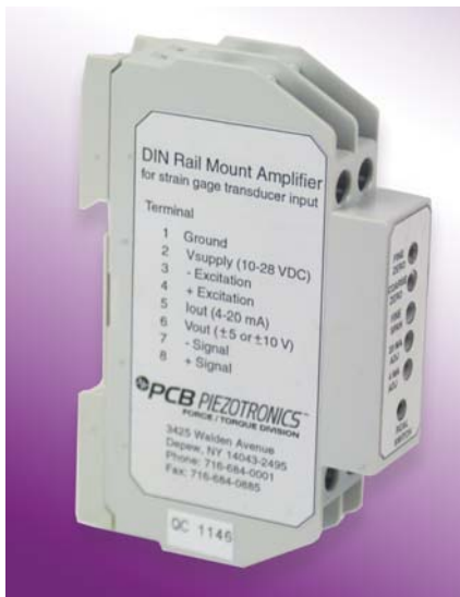
Series 8161 DIN Rail Mount Signal Conditioner

The Series 8161 DIN rail mount signal conditioner provides DC voltage excitation for strain gage sensors, such as load cells and reaction torque sensors, and provides conditioned output signals for test, measurement, and process control requirements. The unit is ideally suited for installation in control panels or systems, which utilize DIN rail mounting schemes to accommodate a high density of instrumentation, or where space is at a premium. Fabricated skid systems, with fixed conditioning and control requirements will benefit from the unit's ease of setup and tamper free architecture. Recessed potentiometers and switches facilitate all setup adjustments.