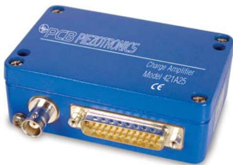
Series 421A25 Industrial Charge Amplifier

The Model 421A25 industrial charge amplifier is designed for piezoelectric charge output force or strain sensors and is ideally suited for monitoring manufacturing forces experienced during assembly, crimping, stamping or product testing. With its long discharge time constant and high frequency response, both quasi-static and dynamic measurements up to 20 kHz are possible.