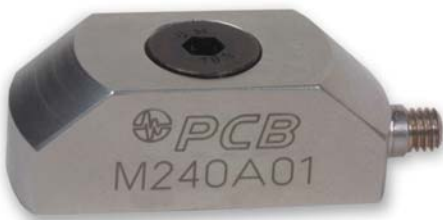
Series M240 ICP® Strain Sensors