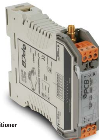
Model 410A01 ICP® Sensor Signal Conditioner