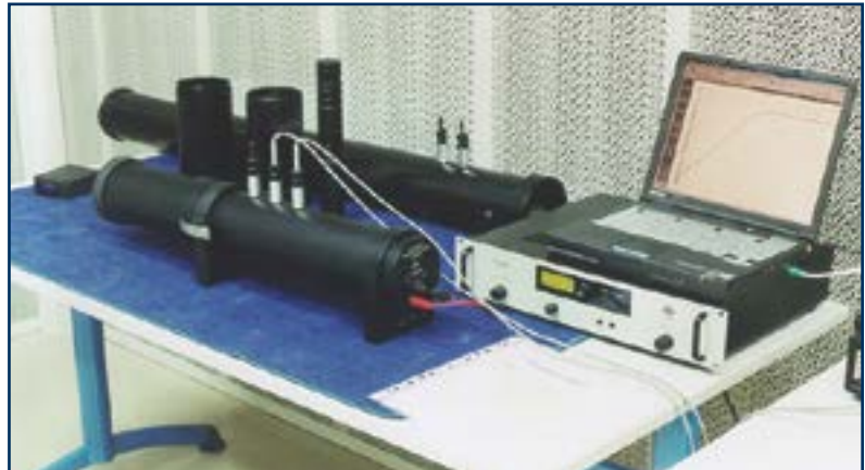
Sound Absorption Test With Impedance Tube