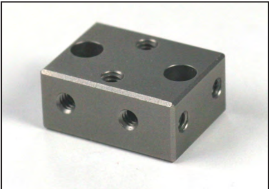
Triaxial mounting block for Model 3991B11XXKG (Screw 080A110)