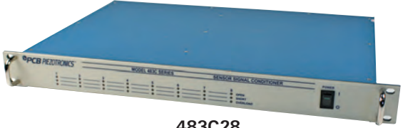
483C28 8-channel version, computer control only

As with all PCB® instrumentation, this model is complemented with toll-free application assistance, 24-hour customer service and is backed by a no-risk policy that guarantees satisfaction or your money refunded.