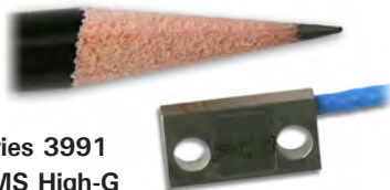
Series 3991 MEMS High-G Shock Accelerometer