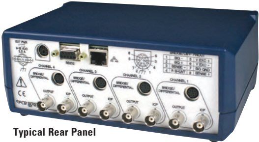
Typical Rear Panel

The Model 482C27 four-channel, benchtop signal conditioner is full-featured and cost effective. It offers low noise operation and simplicity of use. Each channel is selectable between two input types: Bridge/MEMS or ICP®/Voltage.