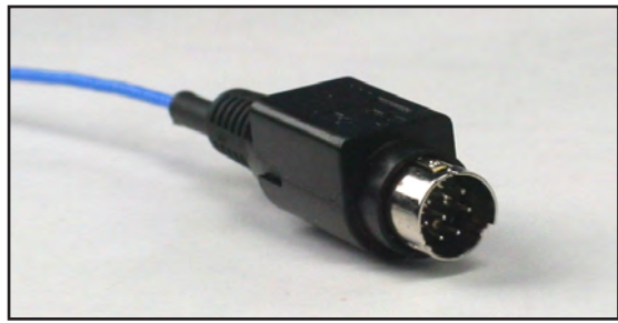
Bridge input mating connector