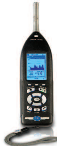
Sound Level Meter 831-RI