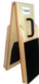
Impulsive Source BAS006