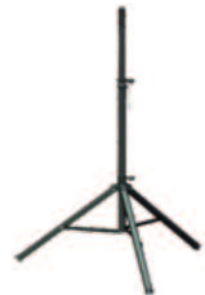
Heavy Duty Tripod TRP023