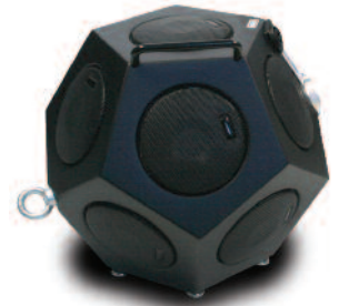
Omnidirectional Source BAS001